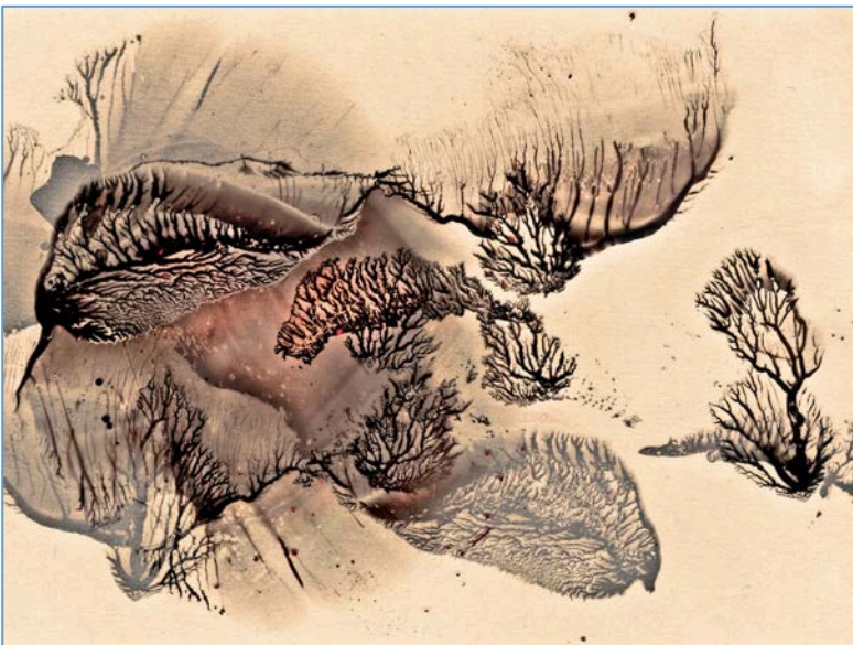
A Walk in the Wild Side

The project grew out of combustion experiments of old cellulose film and China ink. Those experiments brought out fractures and complexes resembling organic cells and neural networks as if inorganic, organic and psychic matter were made of the same nature.